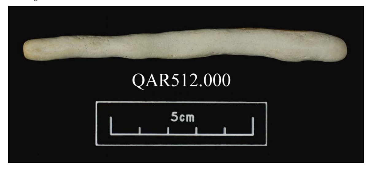
Figure 5 Possible Pipe Tamper (512.000)

of sand resulting in a textured or grainy underside. Another possibility is that the clay was poured into a tube-like mold, and then settled out to the point where the heavier particles in the clay migrated to the bottom and the smoother clays rose to the surface of the object, prior to firing. No mold seams are visible on this object, though burnishing is evident on the smoother side. A more thorough search of smoking pipe accoutrements from a diversity of sources could reveal additional information as to the source and exact function of this object. No conservation or applications of chemicals were applied to this artifact, thus it remains unbleached and exhibits telltale staining of smoking use.