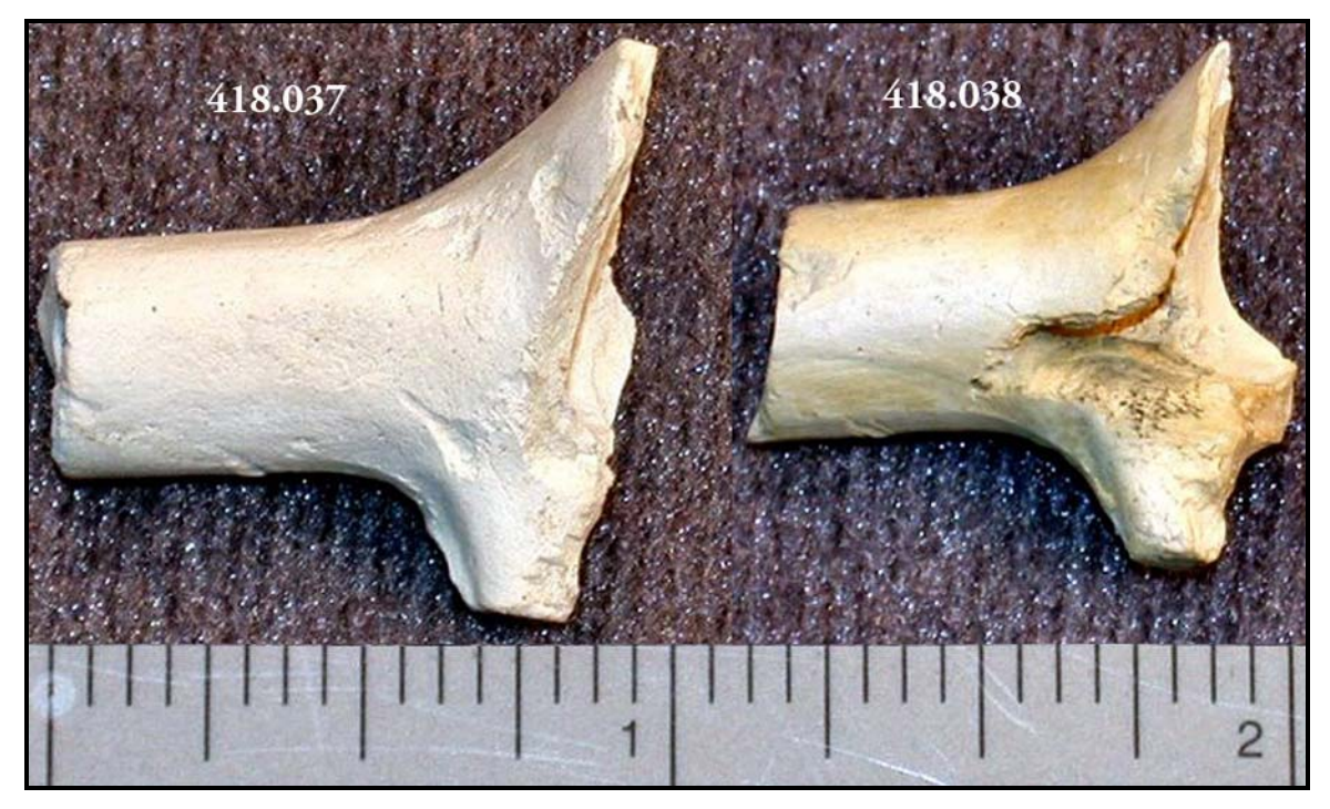
Figure 2 Specimens 418.037 (L) and 418.038 (R)