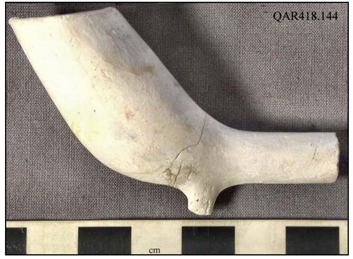
Figure 4 Pipe bowl and stem section (418.144)