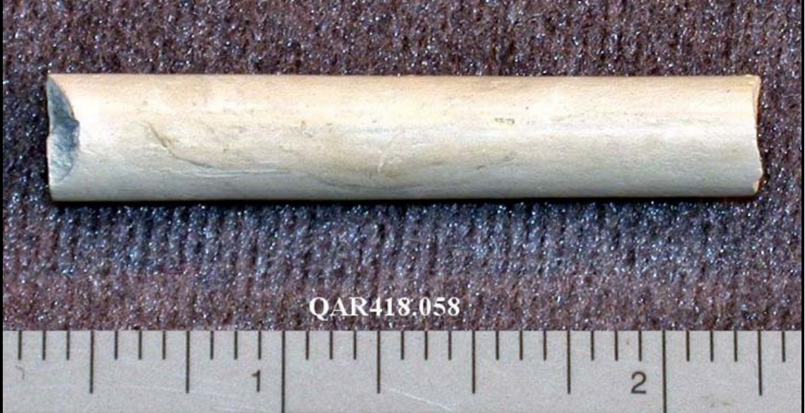
Figure 3 Pipe Stem Fragment (418.058)